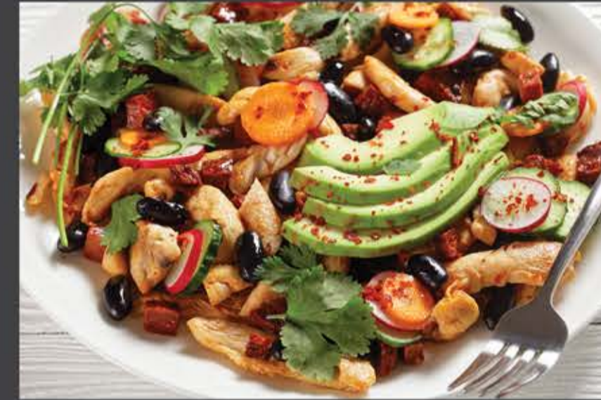
Yo Loco Salad 28 black beans, radish, chili, tomatoes, avocado, cos lettuce, spanish onion, tostadas