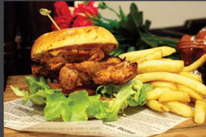
El Pollo Burger 24 chicken, lettuce, tomato, cheese and siracha aioli served with chips