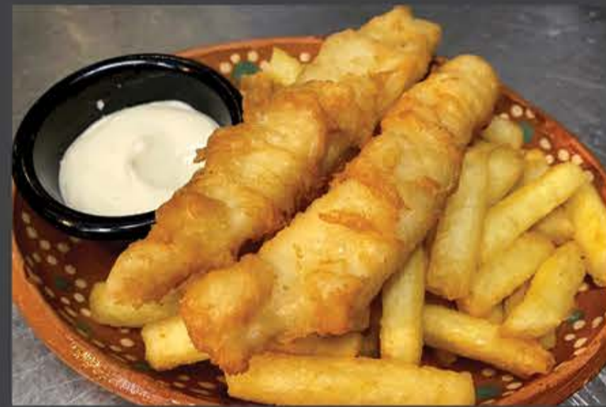
Fish and Chips 13 served with tartare and lemon