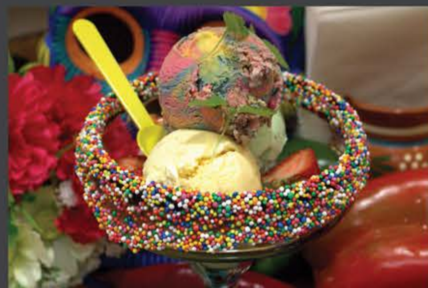
Gelato Ice Cream (Flavours)