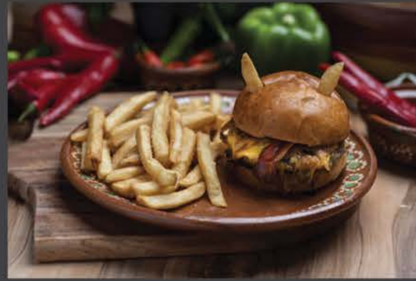
Toro Burger 24 beef patty, bbq sauce, cheese, bacon, camaralised onion, mayonnaise, Mexican spices served with chips