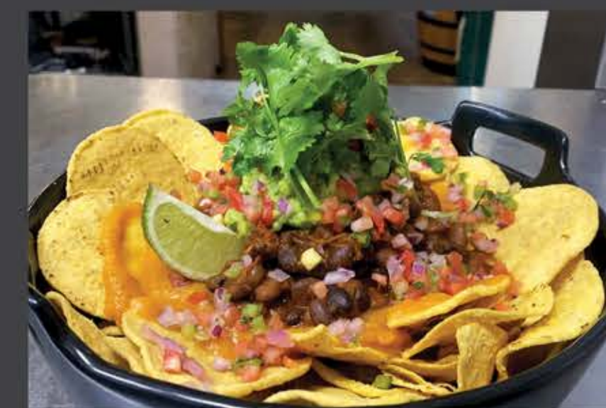
Vegetarian Nachos 28 guacamole, pico de gallo, beans, coriander, onion and vegan sauce