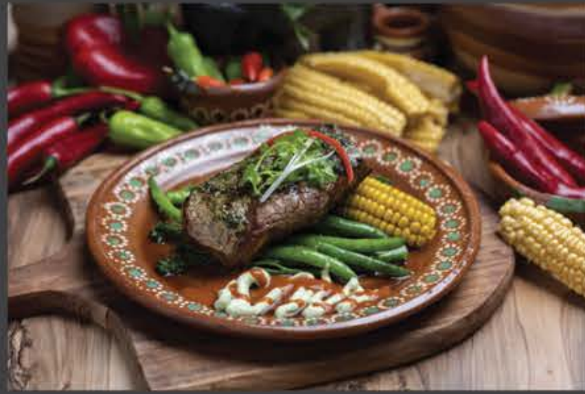
Grainfed Scotch Fillet 40 Grainfed scotch fillet served with chips /saffron rice /Seasonal green and gravy/Mushroom sauce.