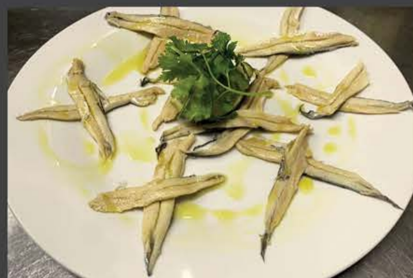
White Anchovies 14 with lemon, olive oil and coriander