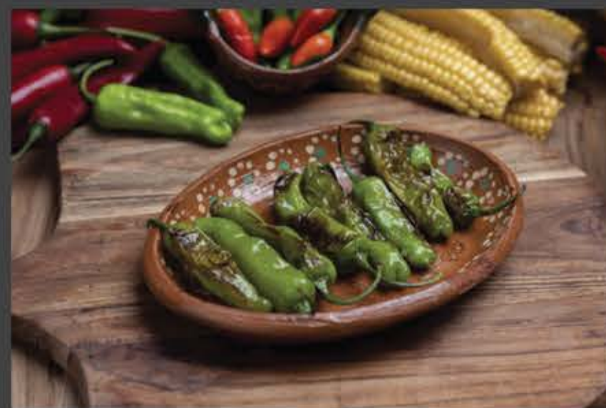
Roast Green Peppers 12 blistered in olive oil and sea salt