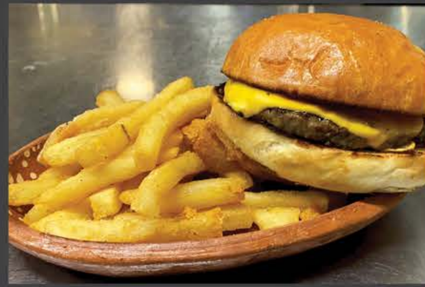
Mini Toro Burger 13 tomato sauce, cheese