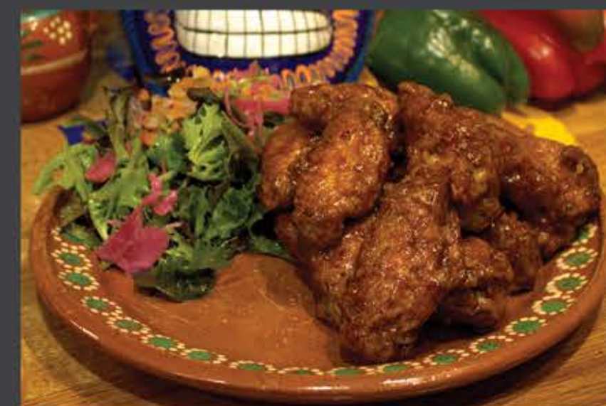
Yo Loco Chicken Wings 14pcs/24pcs marinated in a special, spicy house sauce