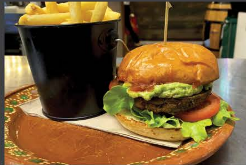
Kale Burger 21 kale patty with pickled onion, relish, lettuce and tomato