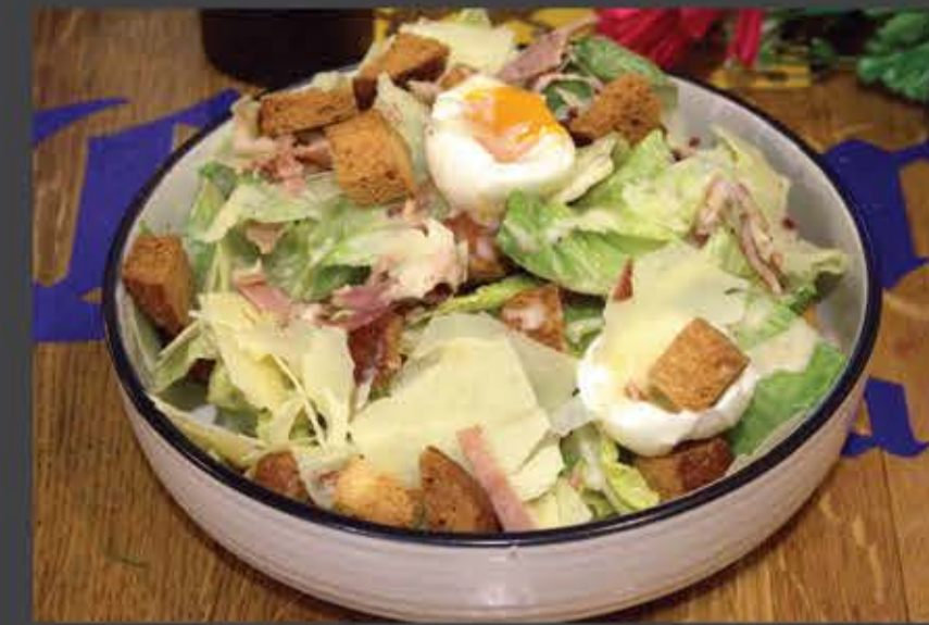
Caesar Salad 21 cos lettuce, parmesan cheesem egg, croutons, fried bacon with a caesar dressing