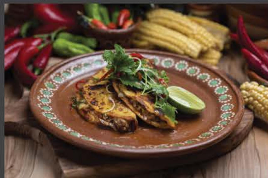
Birria Taco 22 pulled brisket in a birria sauce