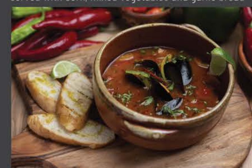
Mussel Bowl 35 soup served with garlic bread