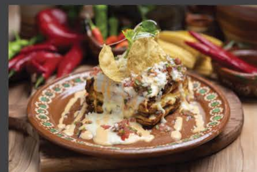
Mexican Lasagne 30 Layered braised beef brisket, tomato, manchego cheese, sour cream and pico de gallo