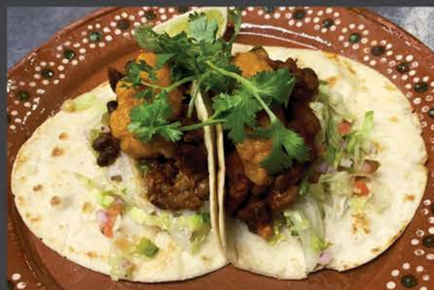
Vegetarian Taco 16 mixed bean, lettuce and pico de gallo and birria sauce