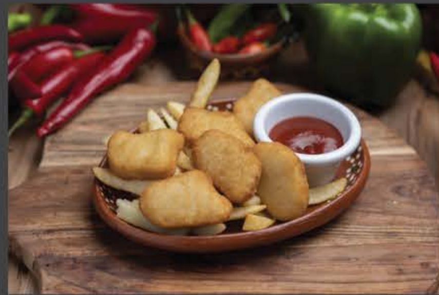
Nuggets and Chips 13 served with tomato sauce