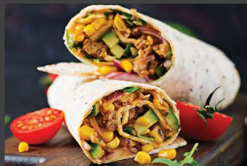
Burrito 30 Rice, shredded beef, cheese, guacamole, lettuce, salsa and hot sauce wrapped in tortilla bread. Comes with chips/Seasonal greens.