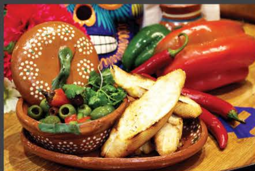
Marinated Olives 12 served with tortilla chips