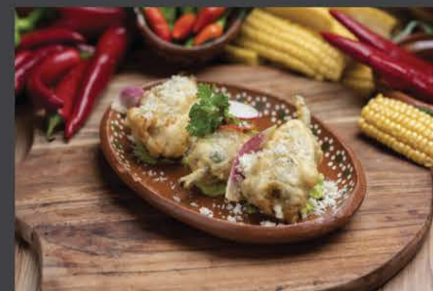
Zucchini Croquettes 16 manchego cheese and romesco