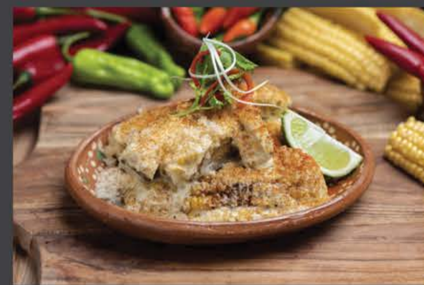
Corn Riblets 15 with Mexican spices, aioli, Spanish cheese, coriander and lime