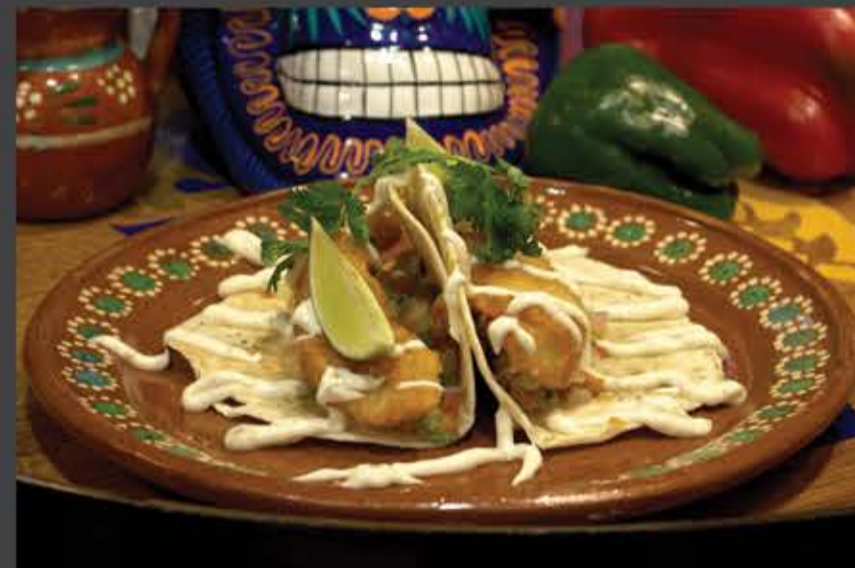
Fish Taco 21 battered flathead, lettuce, pico de gallo and tartare sauce