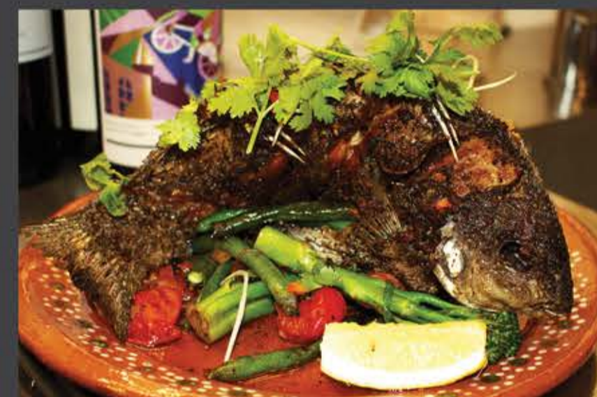
Not so happy Fish 28 Whole fish cooked to perfection, served with seasonal greens/saffron rice and topped with house sauce.