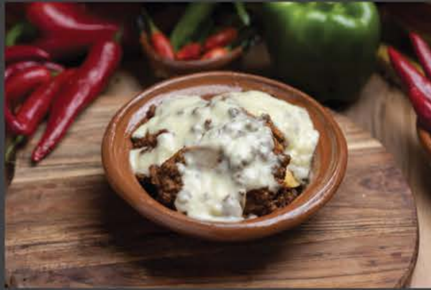
Nachos 12 ground beef and cheese sauce