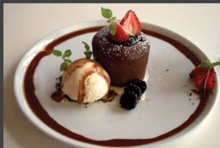
Chocolate Lava Cake