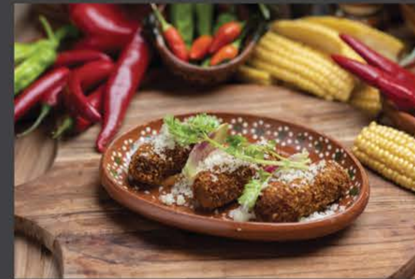
Jalepeno Poppers 16 stuffed with queso blanco cheese, battered and fried