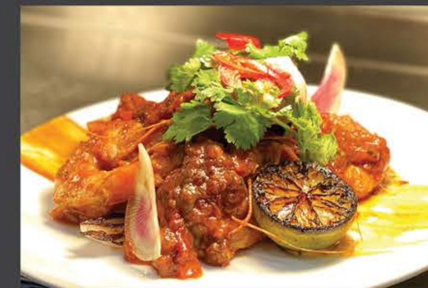
Gambas al Ajillo 26 king prawns cooked in paprika, cayenne and chardonnay served with fresh lemon and fresh bread