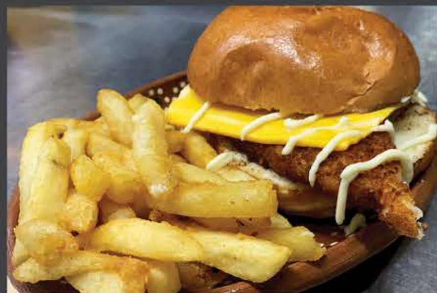
Mini Schnitty Burger 12 cheese and mayonaise