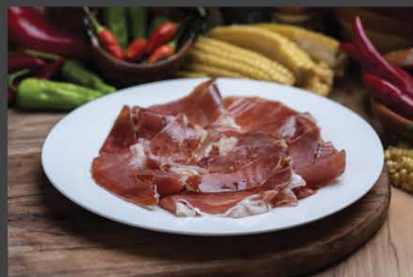
Prosciutto Plate 18 24 month aged Spanish ham