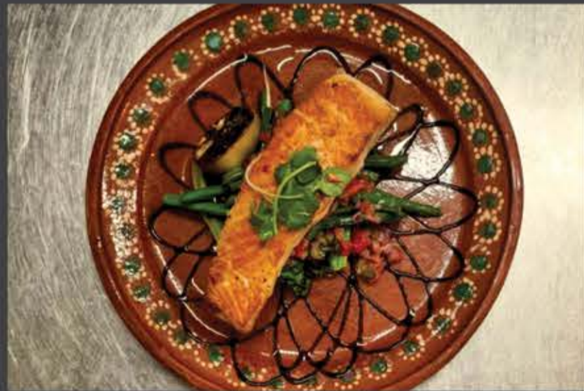
Grilled Salmon 35 Seasonal green vegetable, lemon dressing.