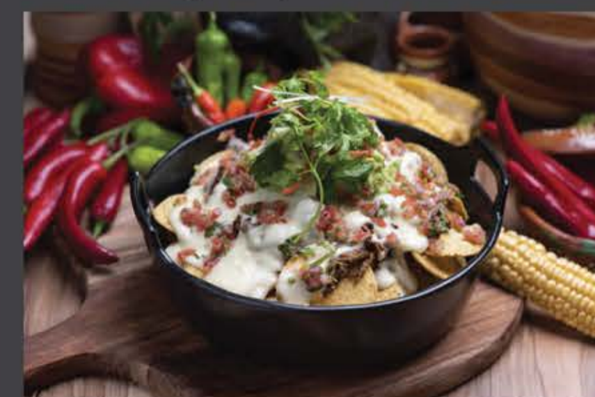
Brisket Nachos 30 manchego cheese sauce, guacamole and pico de gallo