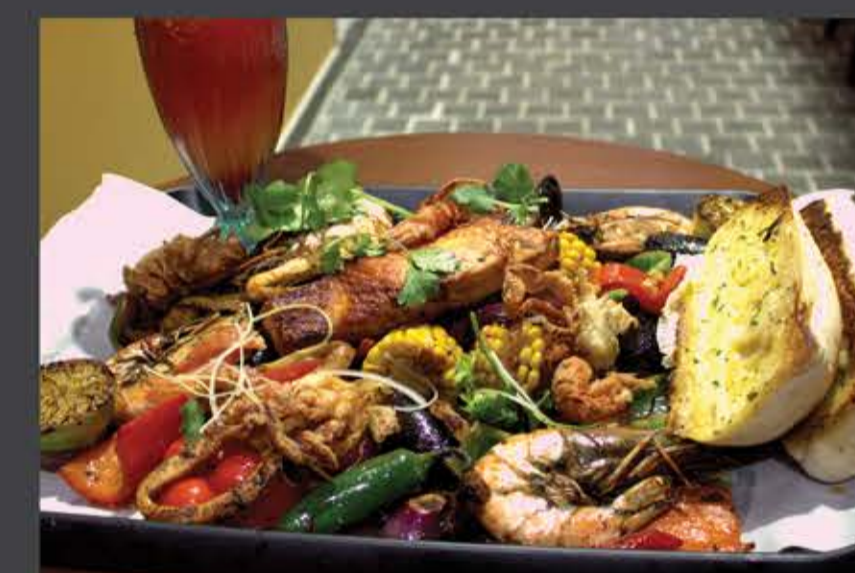
Yo Loco Seafood Platter for 2 120 mussels, prawns, scallops, fish, octopus, served with corn, mixed vegetables and garlic bread