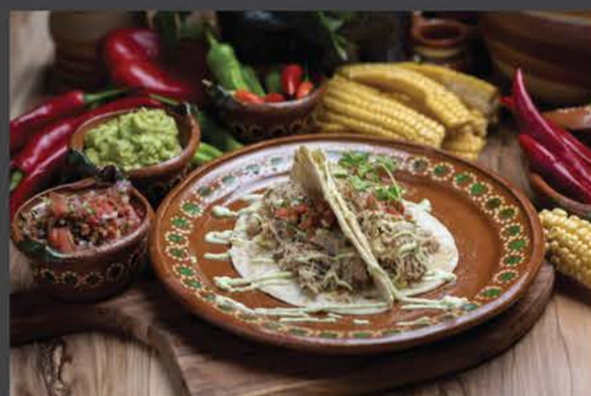
Chicken Taco 18 Pulled chicken with pico de gallo, lettuce, onion jalapeño salsa, lime and coriander.