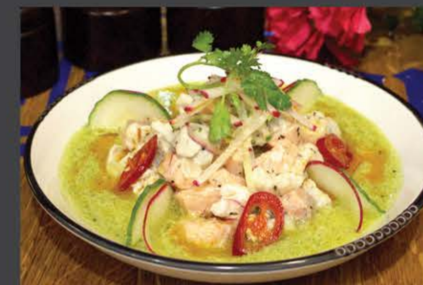
Ceviche 26 diced fish and octopus with salt, pepper, onion, lime juice and coriander