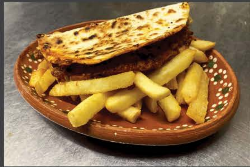
Tacos 12 ground beef and cheese