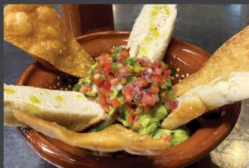
Guacamole Bowl 12 served with fried tortillas