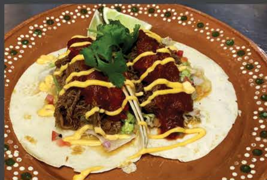
Beef Taco 20 pulled brisket served with lettuce, pico de gallo