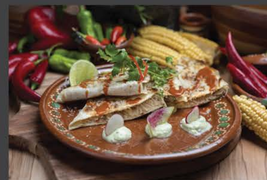
Chicken Quesadillas 26 chicken served in a tortilla bread with Manchego cheese