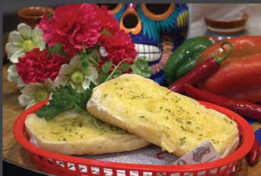
Garlic Bread 9