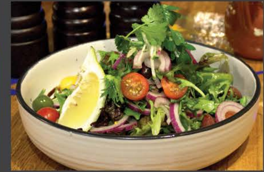
Garden Salad 18 mixed lettuce, olive, spanish onion, tomato, and lemon vinegarette