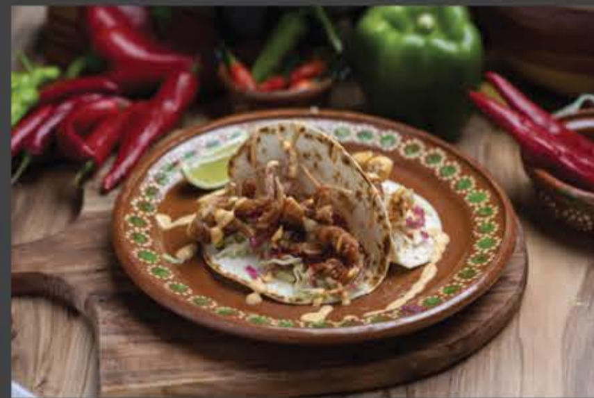
Soft Shell Crab Taco 25 served with lettuce, pickled onion, spiced aioli, and pico de gallo