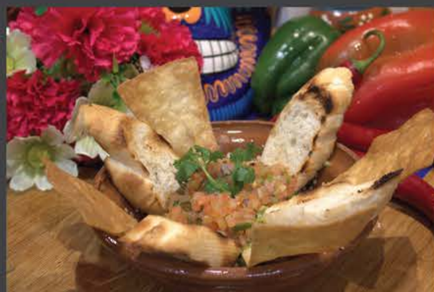
Pico de Gallo 12 served with fried tortillas