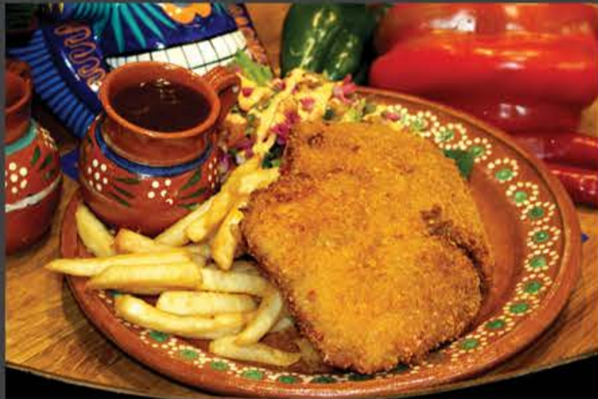
Chicken Schnitzel 26 crumbed chicken served with chips and house salad