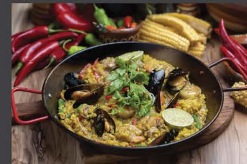
Seafood Paella 70 Spanish sharing rice with king prawns, mussels, chicken, beans, roast peppers, tomato and saffron