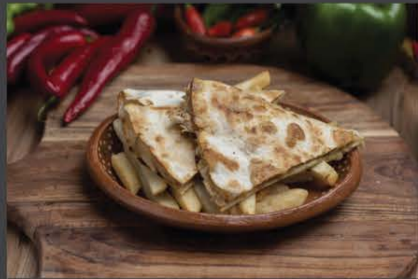
Chicken Quesadillas 14 pulled chicken and cheese