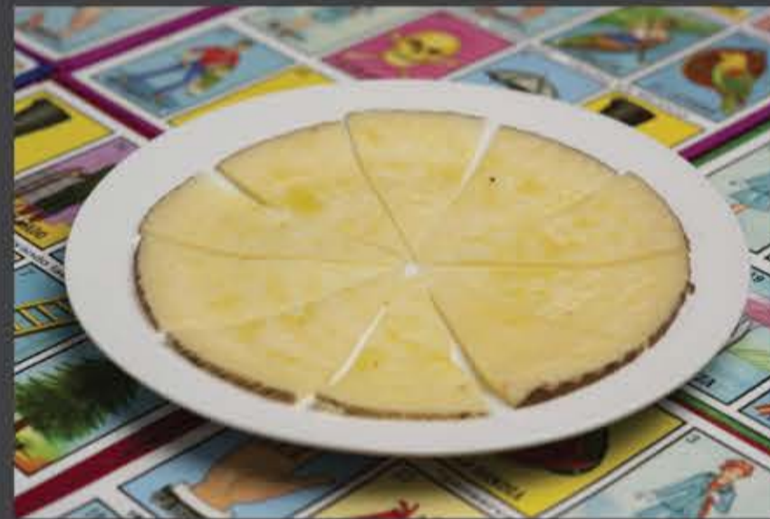
Manchego Plate 16 12 month aged Spanish cheese