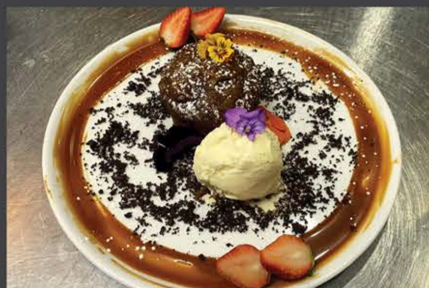
Sticky Date Pudding